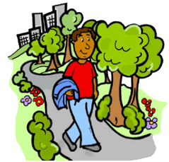
Walk in the park