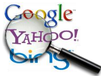
Search the net