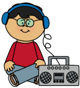
Listen to the radio