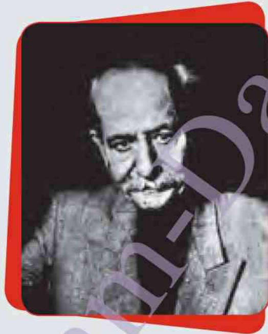
Allameh Ali Akbar Dehkha

His popular nickname was Jahan Pahlevan (the World Champion). He was an Iranian Olympic Gold-Medalist wrestler and Vazesh-e-Bastani practitioner.